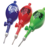
Pocket Pump (Black Only)