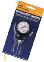
Deluxe Ball Pressure Gauge