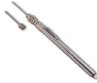
Ball Pressure Gauge