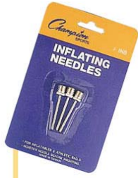
3-Pack Needles $2.00