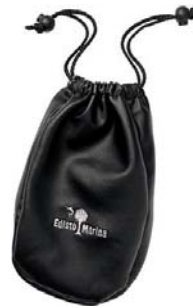
Whistle Bag $5.00